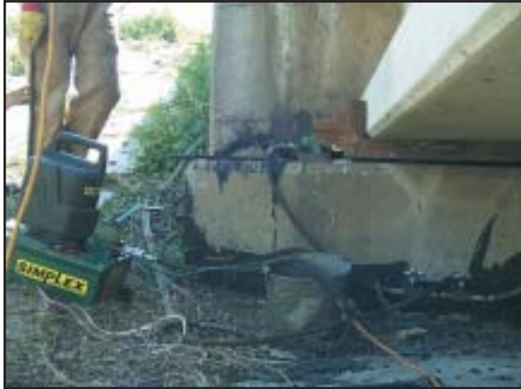
Simplex 70 Series pump & 50 ton flat jack cylinders makes easy work of bridge lifting. "We had to make complete bearing change outs on 90 bridges along Interstate 80. The Simplex 70 Series pump with its permanent magnet motor just kept running even with long extension cord and portable generator power."