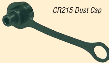
CR215 Dust Cap