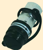
CT211 Ram Half Coupler with Dust Cap