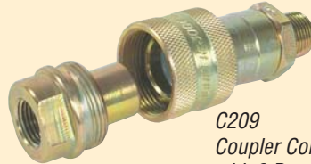
C209 Coupler Complete with 2 Dust Caps

These premium grade couplers provide maximum fluid flow and are plated to resist corrosion. Cylinder Half Couplers have male 3/8" NPTF threads & high strength rubber dust caps; Hose Half Couplers have female 3/8" NPTF threads.