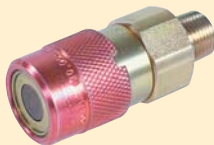
C511-Ram Half Coupler