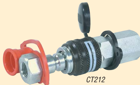
CT212 Coupler Complete with 2 Dust Caps

Unique flush face design features push to connect operation with an auto lock sleeve on the CT211, and non-spill "dry" disconnect operation. Easy cleaning minimizes system contamination. This coupler should be used wherever oil spillage constitutes a safety or environmental hazard. Couplers have 1/4" NPTF threads.