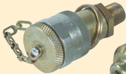
CT201-Ram Half Coupler