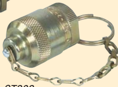
CT202 Hose Half Coupler