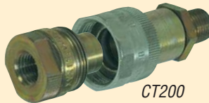
CT200 Coupler Complete with 2 Dust Caps

For use on smaller tools, pumps and any tool with 1/4" threads. These couplers are plated to resist corrosion. Cylinder Half Couplers have male 1/4" NPTF threads; Hose Half Couplers have female 1/4" NPTF threads.