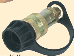
C211-Ram Half Coupler