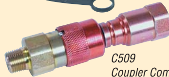
C509 Coupler Complete with 2 Dust Caps

Unique flush face design features push to connect operation with a sleeve lock, and non-spill "dry" disconnect operation. Easy cleaning minimizes system contamination. This coupler should be used wherever oil spillage constitutes a safety or environmental hazard. Couplers have 3/8" NPTF threads.