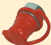
CT210 Hose Half Coupler with Dust Cap