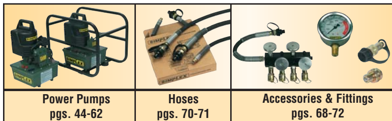
Power Pumps pgs. 44-62