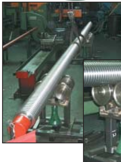
Simplex screw jacks are used to adjust the height of this roller fixture. "We use this fixture during the assembly of long pieces of screw stock." "Simplex screw jacks makes fixturing easy and precise."