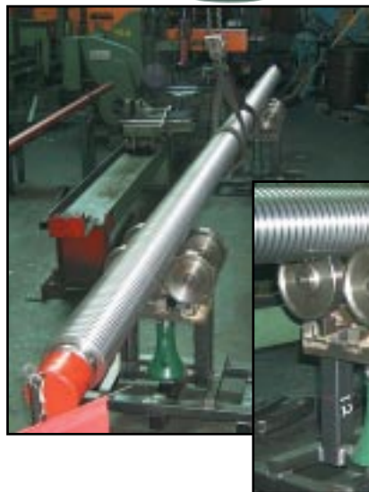
Simplex screw jacks are used to adjust the height of this roller fixture. "We use this fixture during the assembly of long pieces of screw stock." "Simplex screw jacks makes fixturing easy and precise."